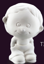
TINY TOT ETHAN DB26772

Signature Series Brush SB802 NO 1 LINER (92452)