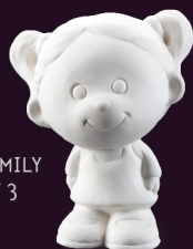
TINY TOT EMILY DB26773

Brushes & Tools Signature Series Brushes SB811 NO 8 ROUND (98606) SB806 NO 6 ROUND (92456)