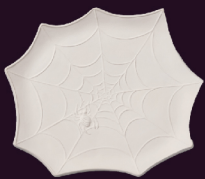
SPIDER WEB PLATE DB38573