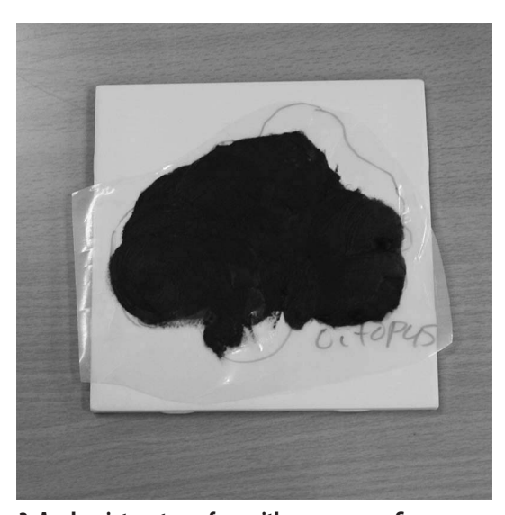
3. Apply mixture to surface with squeegee or finger.