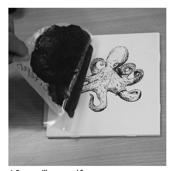
4. Remove silkscreen and fire. IMPORTANT: wash silkscreen after every use.