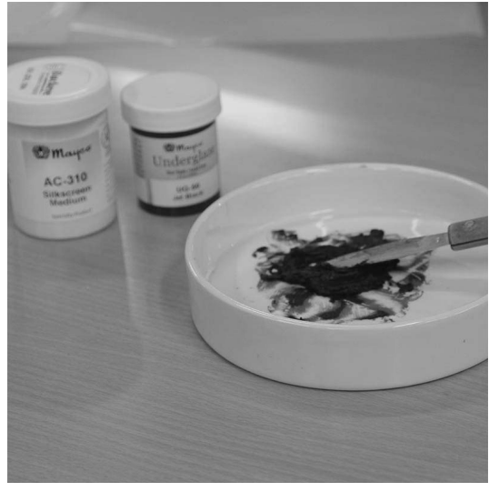
2. Mix with Mayco Silkscreen Medium (AC-310) with glaze to peanut butter thickness.